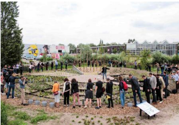
Figure 7. Sponge Garden Rotterdam, URBAN STEIN*