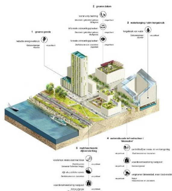
Figure 6. Rotterdam Climate Adaptation Approach

of the program is to move forward to a climate proof city by 2025.