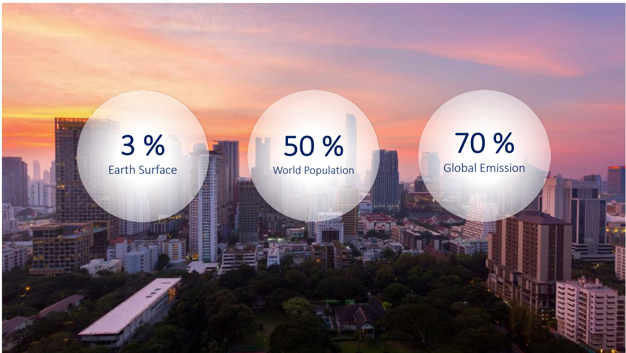
Figure 1. Illustration for urban challenges