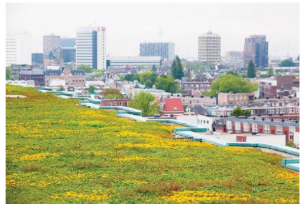
Figure 8. Groothandelsgebouw, Rotterdam

The European Green Cities Development Foundation is established to help solve these urban challenges with Nature-based Solutions, by offering expert trainings, consultancy, networking events, knowledge sharing platform, and facilitating research for enhancing the resilience of future cities around the world.